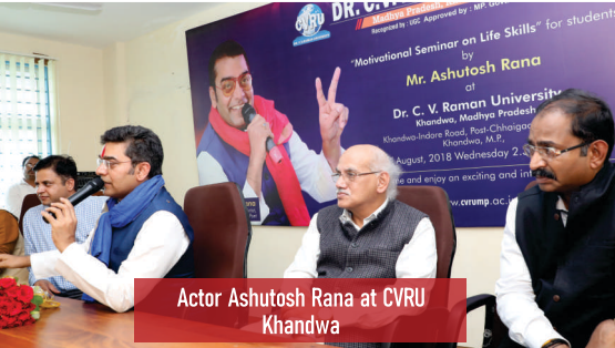
Actor Ashutosh Rana at CVRU Khandwa