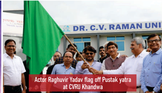
Actor Raghuvir Yadav flag off Pustak yatra at CVRU Khandwa